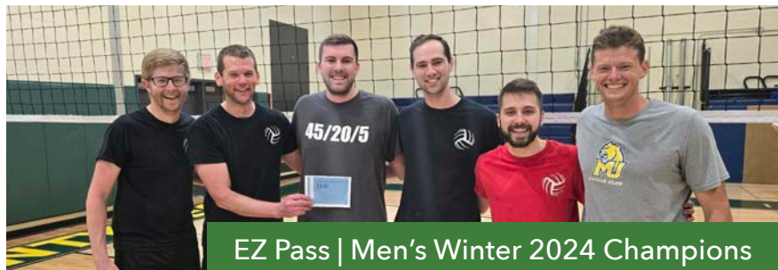
EZ Pass | Men's Winter 2024 Champions