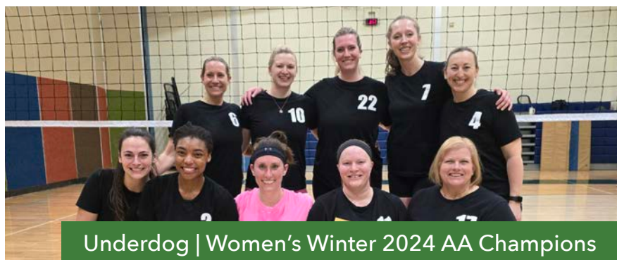
Underdog | Women's Winter 2024 AA Champions