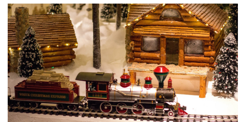
NEW YORK BOTANICAL GARDEN HOLIDAY TRAIN SHOW Thursday, December 7, 2023