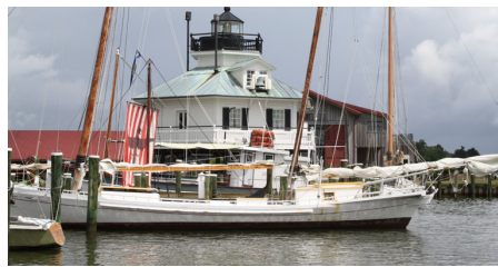
CHESAPEAKE CRAVINGS, MD Tuesday, April 18, 2023