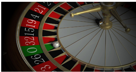
TROPICANA RESORT & CASINO, NJ Thursday, March 30, 2023

To book, contact Boscov's Travel, Camp Hill Shopping Center Call 717-763-1100 or email bostravcamphill@boscovs.com boscovstravel.com