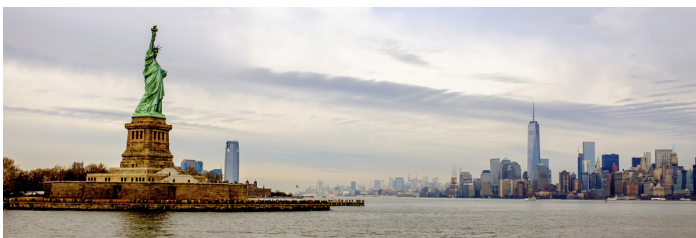
ELLIS ISLAND & STATUE OF LIBERTY Thursday, July 27, 2023