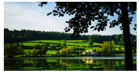
FINGER LAKES, NY May 2023