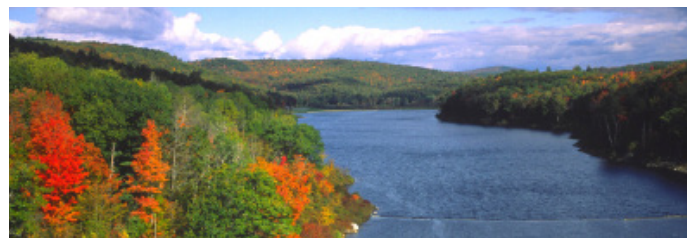
THE CONNECTICUT RIVER VALLEY September 2023