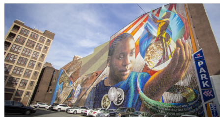
BARNES FOUNDATION & PHILADELPHIA MURAL ARTS TOUR Thursday, November 9, 2023