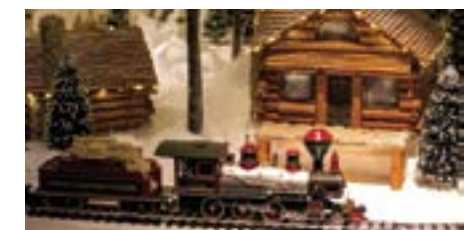
NEW YORK BOTANICAL GARDEN HOLIDAY TRAIN SHOW Thursday, December 7, 2023