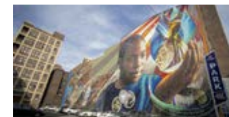
BARNES FOUNDATION & PHILADELPHIA MURAL ARTS TOUR Thursday, November 9, 2023