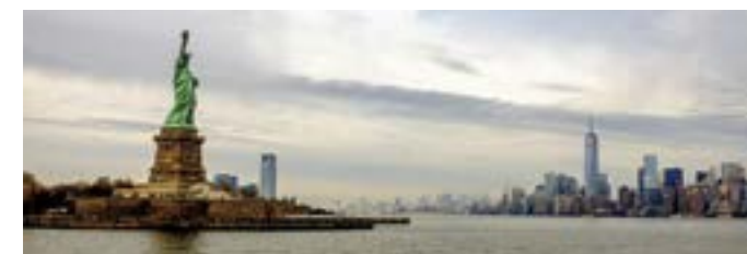
ELLIS ISLAND & STATUE OF LIBERTY Thursday, July 27, 2023

To book, contact Bosco's Travel, Camp Hill Shopping Center Call 717-763-1100 or email bostravcamphill@boscovs.com boscovstravel.com