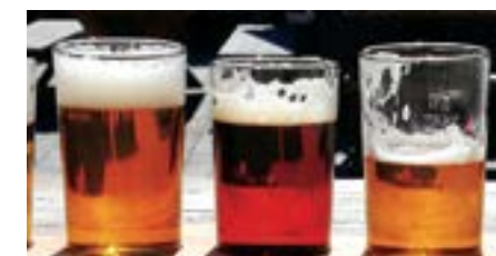
PEDDLER'S VILLAGE OCTOBERFEAST Saturday, October 14, 2023