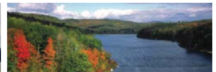
THE CONNECTICUT RIVER VALLEY September 7-10, 2023