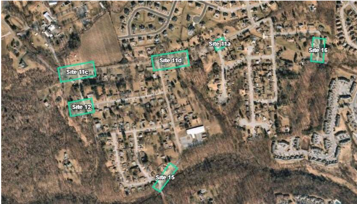
Figure 2: Township Storm Sewer Replacement Crew Work Areas - South