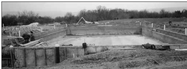
The Lap Pool area which is used today for learn to swim, swim teams and fitness workouts/programs.